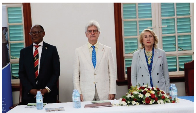
Visit by the International Rotary President Francesco Arezzo during the 9th Capstone