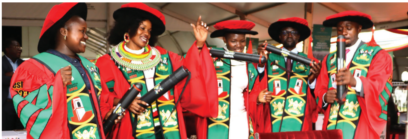
A section of PhD candidates after the graduation in the Freedom square on February 27 th in University Freedom Square