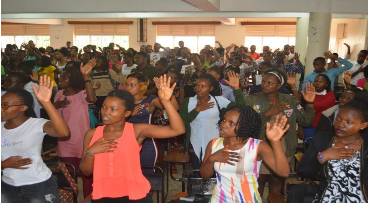
Photo credit: Makerere University COBAMS Students reciting the BANG DECLARATION in March 2019